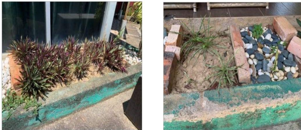
Figure 1.2 Dried soil and plants at Surau Ar- Raudah

Therefore, there is a need to develop an innovative and sustainable solution that can collect, store, and reuse ablution water efficiently. The Eco-Wudu Sustainable Watering System was developed to address this issue by integrating ablution water harvesting, automatic irrigation control, soil moisture monitoring, and solar-powered operation. This system aims to reduce water wastage, minimize dependence on the main water supply, and promote sustainable water management practices within the campus environment.